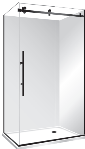
Pictured - Premier Frameless 1200 x 900 2 Sided Black RIGHT HAND Fixed SP12X9BLFWRH