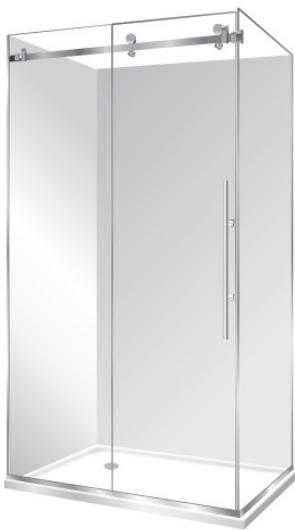
Pictured - Premier Frameless 1200 x 800 2 Sided Silver LEFT HAND Fixed SP12X8SIFWLH