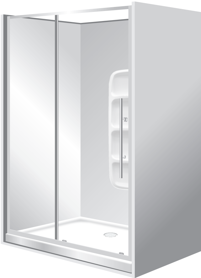
Pictured - Aquero Alcove 900x1200x900 2 Panel Sliding Door White, Moulded Wall