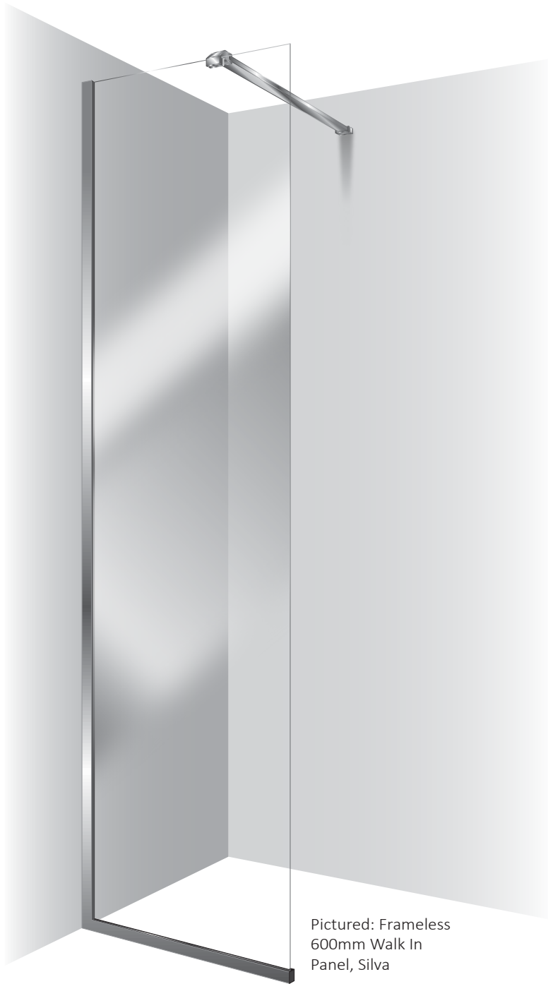
Pictured: Frameless 600mm Walk In Panel, Silva

The Symphony range of frameless walk-in glass panels offers an easy to fit, cost effective and modern way to deflect water in either a tiled floor shower or walk-in style tray.