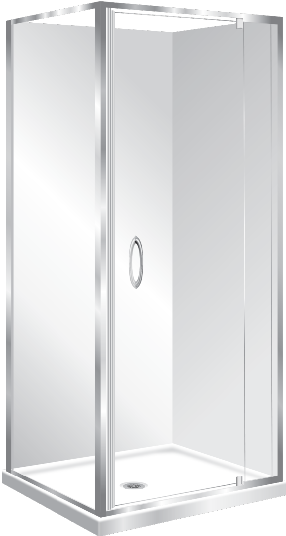
Pictured Above - DEZINE 1000x1000mm Square Shower