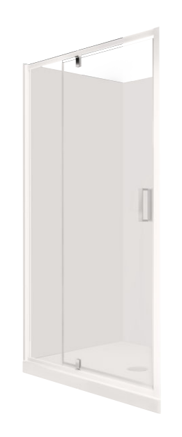
Note: Tapware and accessories illustrated in photography are not included

The Valencia Elite 1200mm Alcove Pivot Shower combines exceptional performance with ease of installation. Beautifully engineered, this shower is available in a range of finishes and wall options. The enclosure features a fully reversible door boasting 6mm toughened safety glass with Englefield CleanLess® glass treatment. The Quick-Fit low profile tray features an ultra high 40mm upstand for maximum watertightness, ensuring long lasting performance.