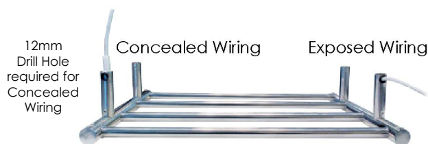
Universal Wiring Options