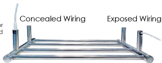
Universal Wiring Options

12mm Drill Hole required for Concealed Wiring