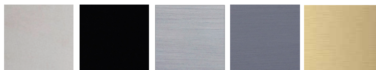
Chrome ST75 Matte Black ST75B Brushed Nickel ST75NK Gunmetal ST75GM Brushed Brass ST75BB