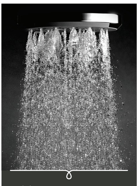
Satinjet<sup>®</sup>. The unmistakable feeling of 300,000 droplets per second.

Unlike conventional showers, Satinjet uses unique twin-jet technology to create optimum water droplet size and pressure, with over 300,000 droplets per second providing greater warmth and coverage. The result is an immersive, full-body experience.