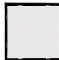
Point drain TILE INSERT FD11XS65-T