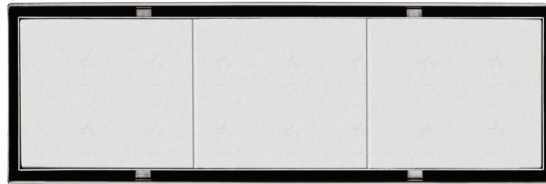
Channel drain - 300mm TILE INSERT FDT300W