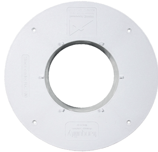
Tile flange – 100mm FLC100