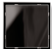
Point drain JAGUAR BLACK GLASS FD11XS65-G

Above point drain sizes: 110mm (l) x 110mm (w) x 21mm (d) - Ø65mm - Required waste flange minimum Ø80mm