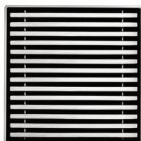
Point drain MESH FD11XS65-M