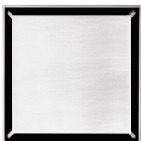
Point drain SOLID - BR SS FD11XS65-SI

Above channel drain sizes: 300mm (l) x 100mm (w) x 21mm (d) - Ø65mm - Required waste flange minimum Ø80mm