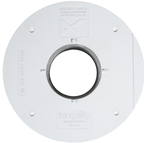
Tile flange – 80mm FLC80

The Tranquillity standard flange acts as an extra seal between the drain and your bathroom tiles.