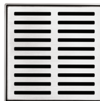
Point drain LINEAR FD11XS65-L