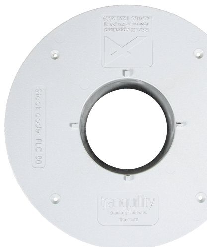
Back to wall flange – 80mm BFLC80

The Tranquillity new back to wall flange allows a closer installation of your channel drain to the wall.