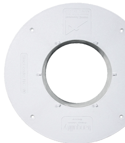
Back to wall flange – 100mm BFLC100

PVC leak control flange | Suitable for all Tranquillity channel drains and point drains Available in 2 sizes - 80mm and 100mm | Promotes adhesion to the waterproofing membrane