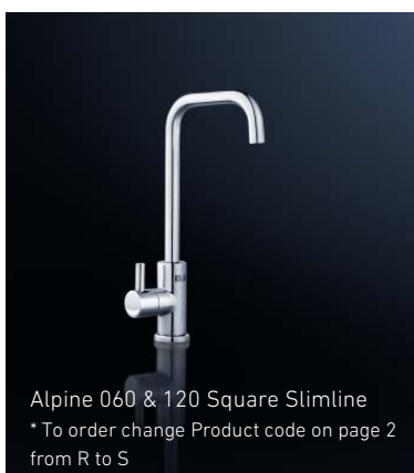
Alpine 060 & 120 Square Slimline * To order change Product code on page 2 from R to S