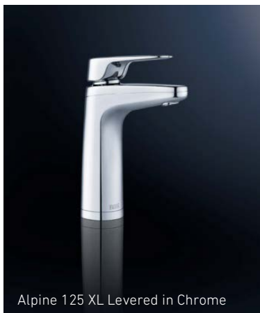
Alpine 125 XL Levered in Chrome

Refreshing chilled or unlimited ambient filtered water.