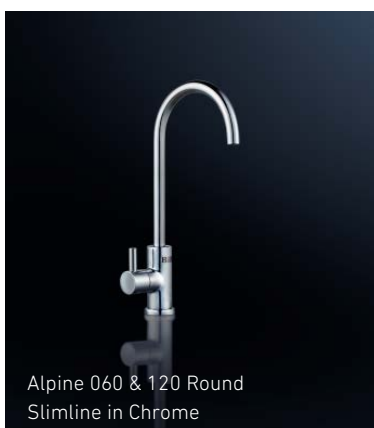
Alpine 060 & 120 Round Slimline in Chrome