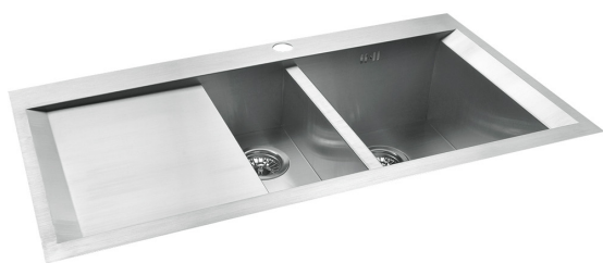
LH draining board

Crisp, geometric design with '90° square corner' bowls, all produced from high quality, brushed stainless. Bowls are 1mm and draining boards 1.2mm thickness.