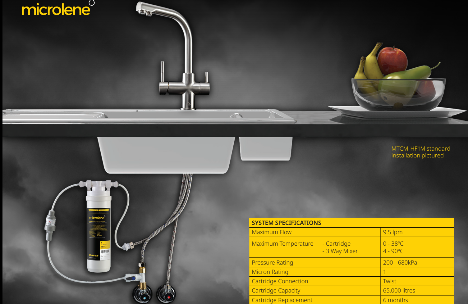
MTCM-HF1M standard installation pictured