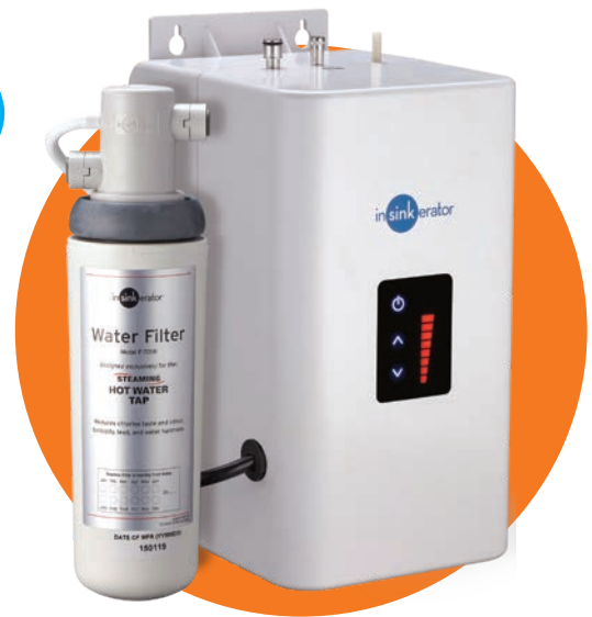
Easy to install under sink tank & water filter