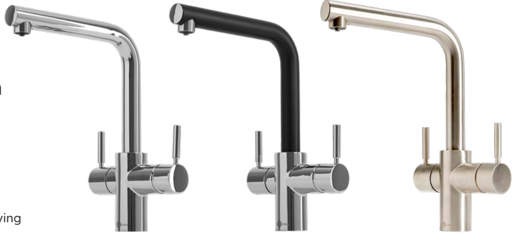
Product Code: MTLIA-CH Finish: CHROME