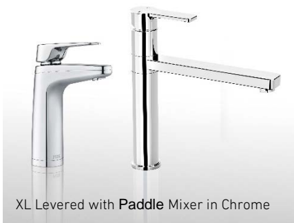
XL Levered with Paddle Mixer in Chrome