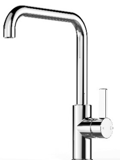
Square Goosneck Mixer in Chrome

* To order a square mixer change Product code on page 2 from LP to LG